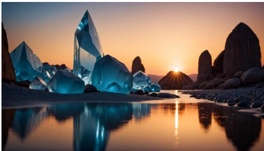
Crystal Sunset by Xcustomgraphix (ukn) – this is a Stable Diffusion XL 1.0 AI image