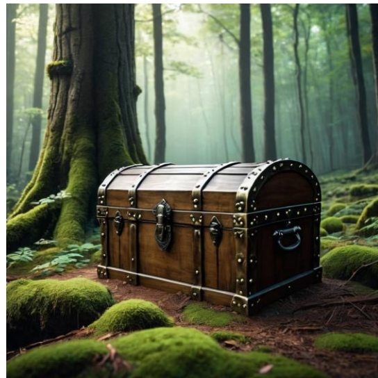
Trunk by Samitdigitalart (India) - think I found the secret of Oak Island