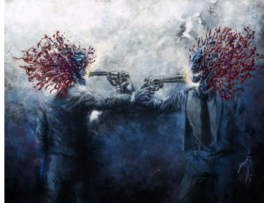
Headshot by Renearturo1 (Canada)