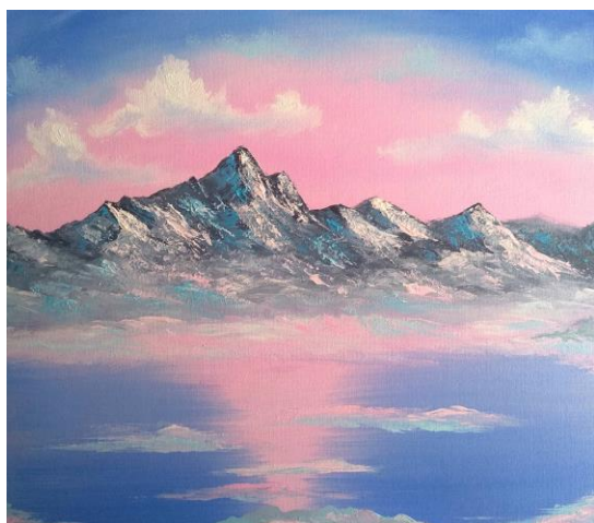
Icy Lands by Harleyhowl - Katya (Russia)