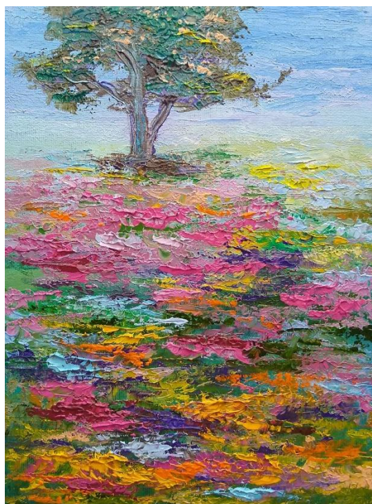
Tree in a Field of Flowers by HarleyHowl