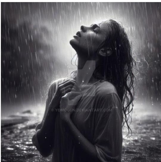
A Portrait of Solitude 2 by Vomogun a.k.a. Rogon Montoku (Singapore)