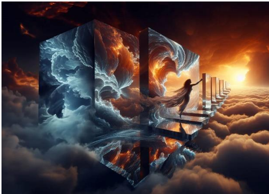
Stairways to Heaven 01 by Takomaru (Thailand)