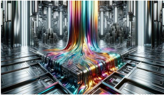
Cyber Rainbow Falls by Silentragex (USA)