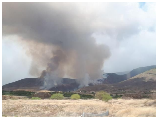
A wildfire in Maui