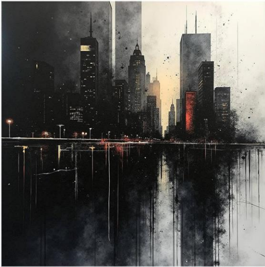
Dark City by _Marwil_Arts (Germany)