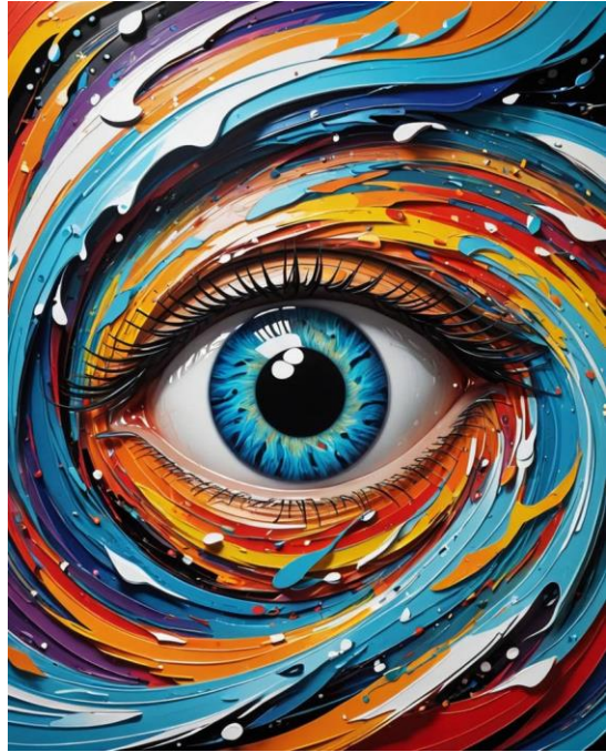
Eye Wall by Creative Mickey (USA)