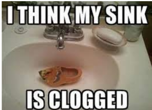
A picture carefully selected for a couple of friends