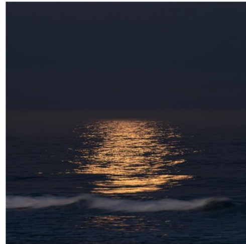
Moon Dust by La-Tete-Ailleurs (France)

The organization is now working on a Rotary grant so that they can return with more and upgraded training. As part of the grant, they are appealing to Rotary Clubs to make a contribution.