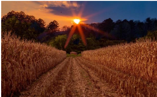
Harvest Time by Swampglam (USA)