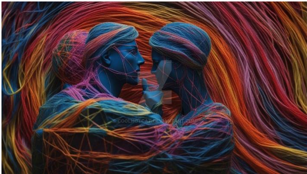
No 16387 by Coolhotcat (India) - AI image