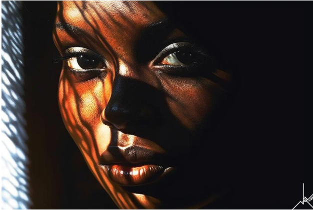
Black Magic Woman 1 by Digitalart (Spain) - AI image