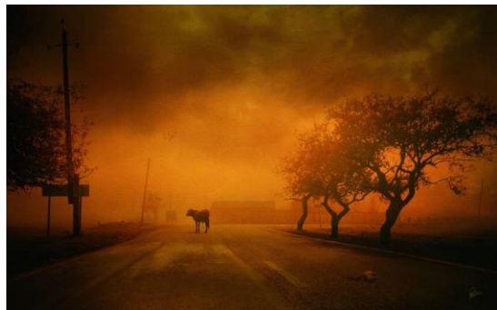
Calls From a Lost Conscience by Moodyblue (Brazil)