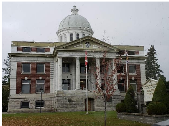
Court house in Revelstoke