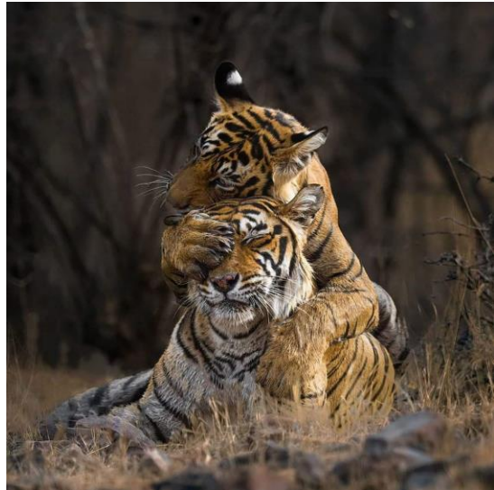
Young tiger hugging? annoying? its mother