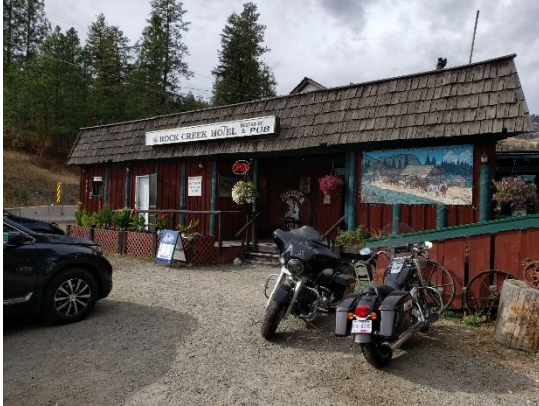
Prospectors pub in Rock Creek