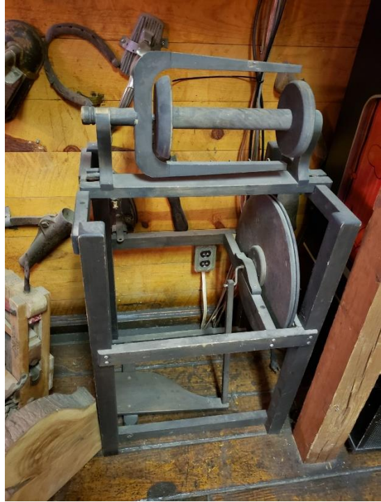
What the heck is that!?