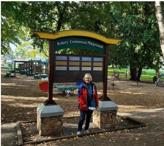
Rotary in action

Shoutout to everyone who can still remember their childhood phone number, but can't remember the password they created yesterday! You are my people!