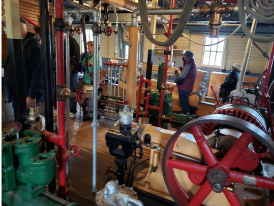
Engine room of the SS Moyie