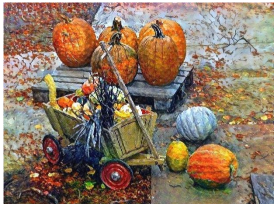
It's Pumpkin Season by Renata S. (Germany)