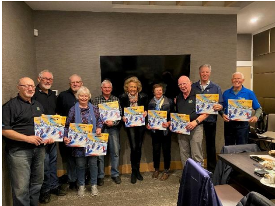
RC Kelowna Capri with their Season of Giving calendars