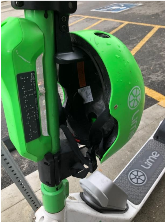
Why do you need braille on these scooters?