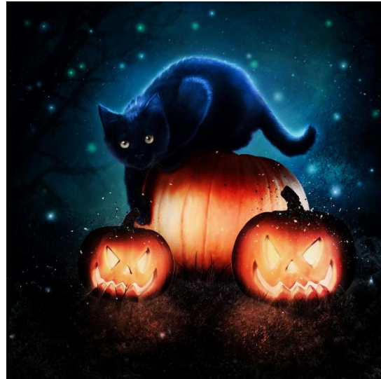
Haunted Cat by Captain Squirel (USA)

It was an interesting presentation and as can be seen in the picture our club members bought calendars in support of their 2023/24 calendar.