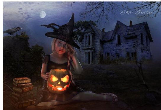
The Little Halloween Witch by Ekta Creation (India) (edit. spelling is a given)