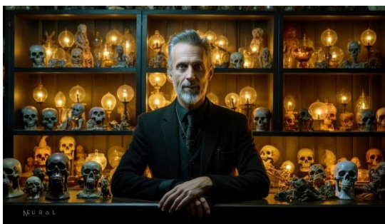
Skull Merchant by Neural Canvas -artist group (USA)

Halloween is approaching and so it's time to share a few pictures.