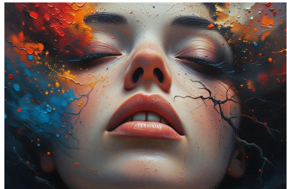
She Who Dreams in Color by Ishi99 (Wepstone AI)