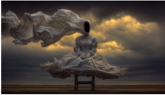
These Hollow Winds by Paige Compositor (Ukn)