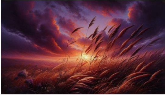
Where the Wind Can Sing by Ryder68 (Norway) – a very Canadian feeling to this picture. I'd like to see one of where the wind can howl.