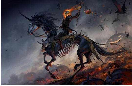
Halloween by Sandara (Singapore)