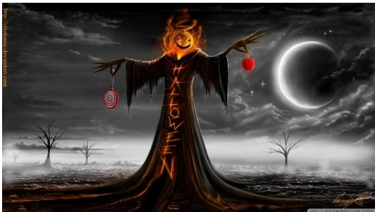
Gothic Halloween Wallpaper. Just the thing for the bedroom. Sweet dreams.