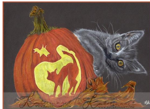
Peekaboo by Katerin Art (USA)