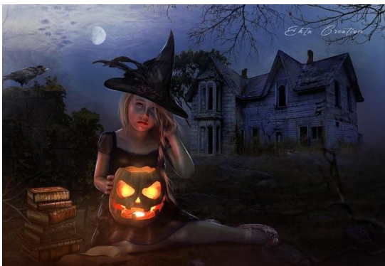
The Little Halloween Witch by Ektapinki (ukn)