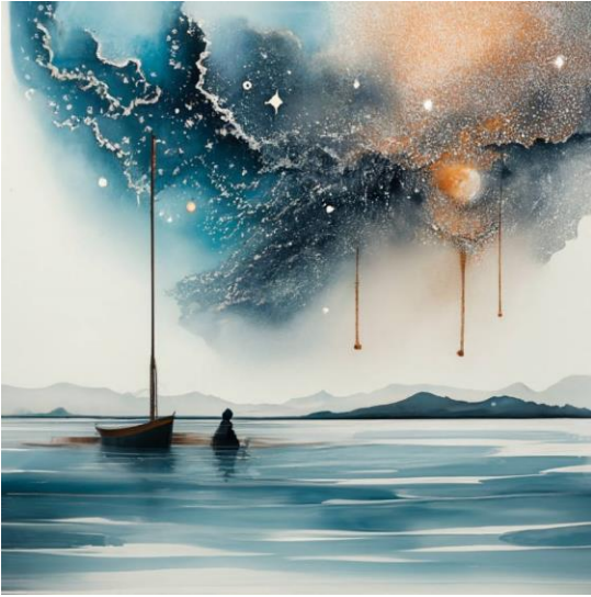
Autumn 2 by Vladimir Sevlani (Ukrainian)