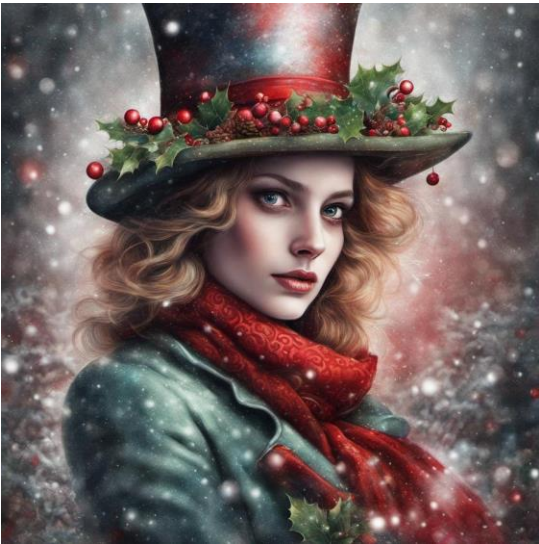
Dreamup Creation by 77tradewinds (USA) - first Xmas image I've seen this year - Sep. 28th. My thoughts on this showing up so early cannot be expressed.