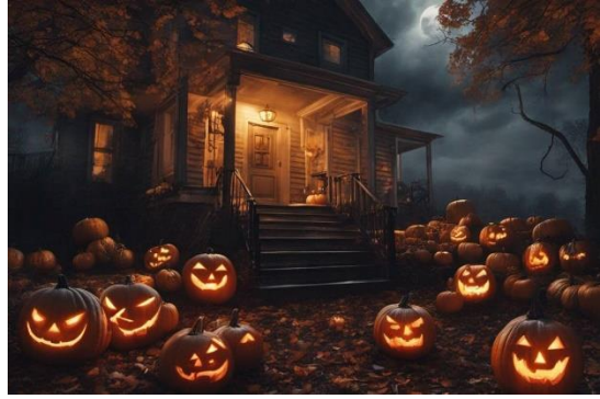
Quintessential Halloween Setting 3 by Azmidnite {USA}