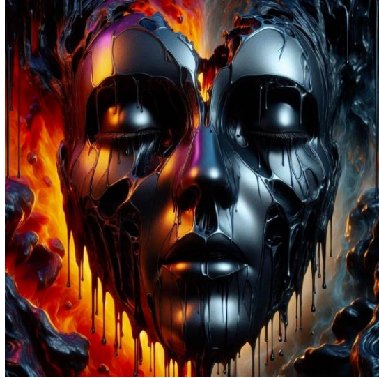
Untitled 47 by Ynot011 (New Zealand)