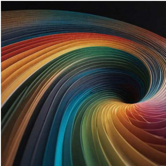
Agnesi Curve by Angolinn (UK)