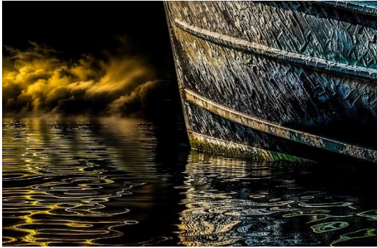
Getting Older by Derbuettner (Germany)