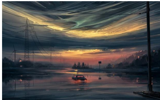
Cover art by Stalkyyyyy (Belgium)

In mathematics, the witch of Agnesi is a cubic plane curve defined from two diametrically opposite points of a circle.