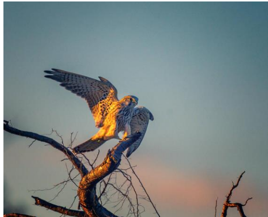
Kestrel by Salty Blue Waves (Norway)