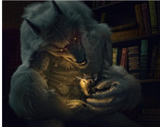
Big Softy by Maruberlin (Ukn)