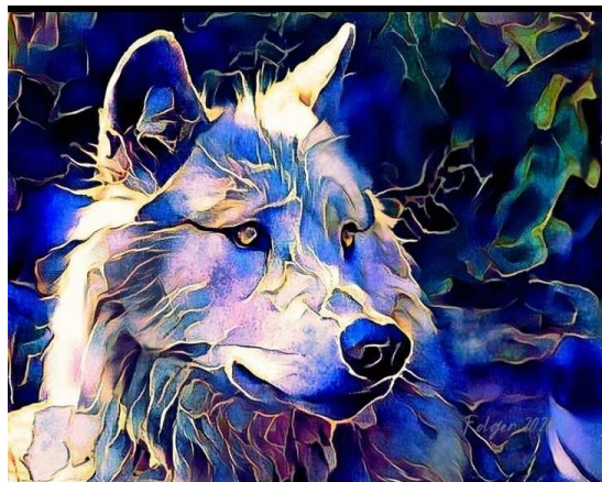
Magic Wolf by Jacob Folger (USA)