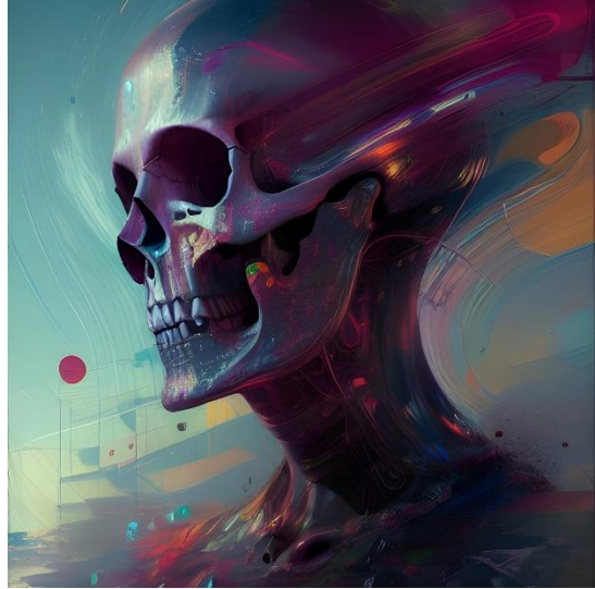
Abstract State of Mind by ILLudox (Netherlands)