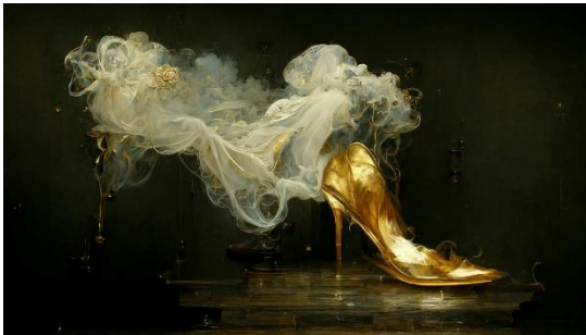
Dark Smoke Atmosphere with Gold Sprinkler Heel by Benette Covers (France)