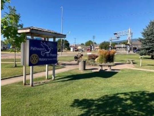
Peace Park in Vernon

Caribbean Night - a fundraiser for Rotarians, spouses, and friends. A flier for this event has been sent out to all members and friends.