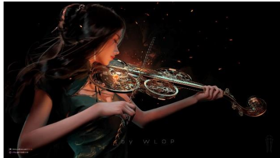
Civilization 4 – Let There be Light by WLOP (People's Republic of China)