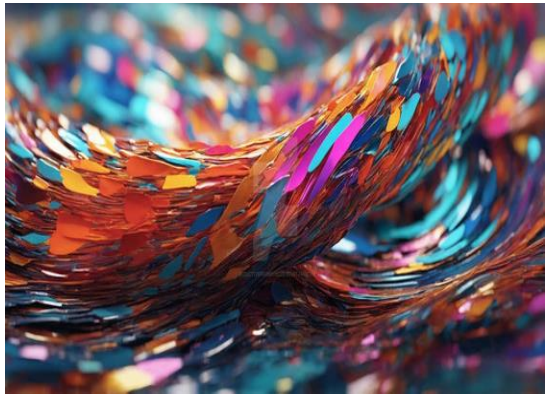
Abstract Beauty by Addictiveprompts2 (Ukn)