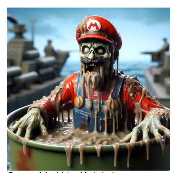
Return of the Living Mario by Legacy Gamingmods (Ukn)