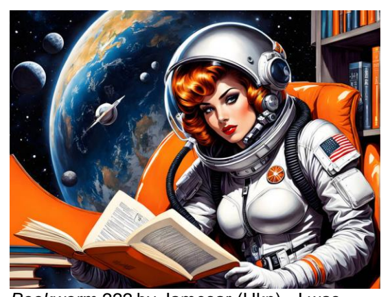
Bookworm 222 by Jamesar (Ukn) - I was attracted to this picture by recalling the covers on old science fiction pulp magazines as I was growing up