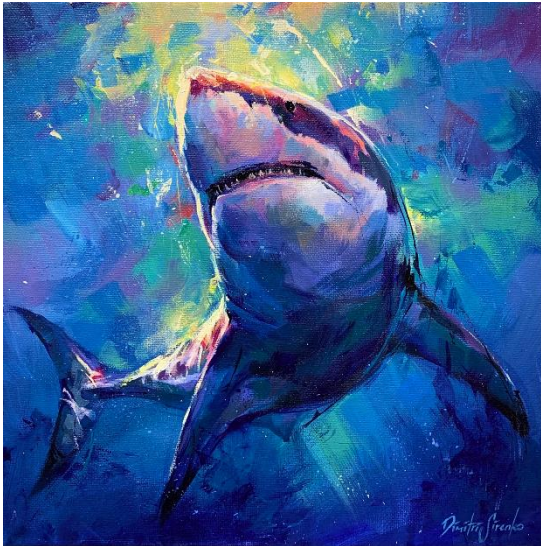
The Hunter by Dimitri Sirenko Art (Canada)