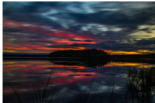
Red Clouds II by Markus (Finland)