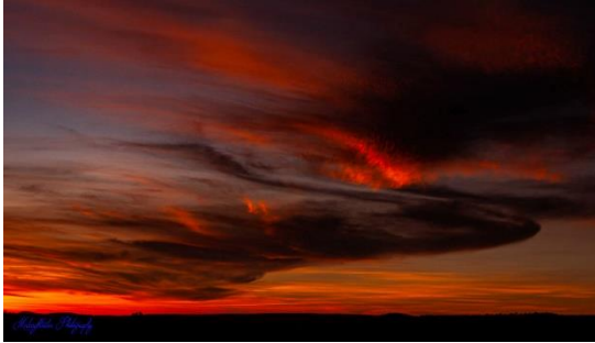
When I Think of You by Midnightrider79 (Australia)