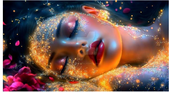
The Rose-Kissed Oracle by Sheila Digital (Shiela Rose; USA)