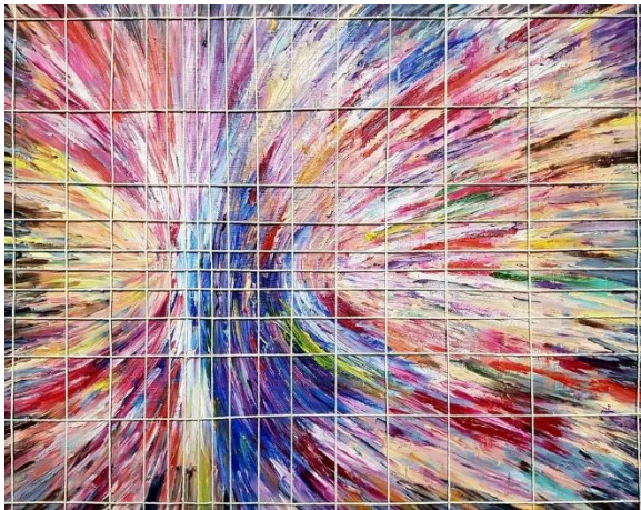
Order Chaos Study 201802 by Amjknight (UK)