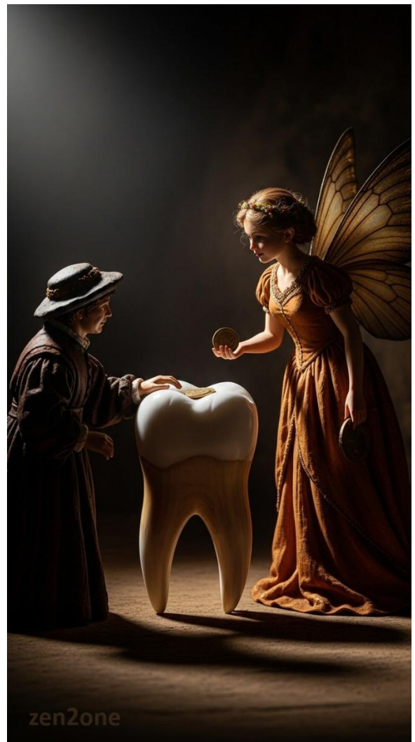
Let's Make a Deal by ZenZone (USA)