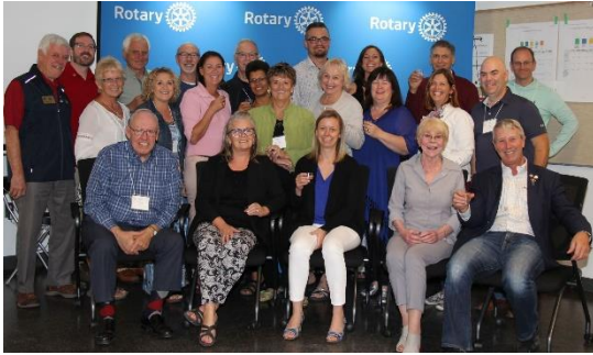
The RLI seminar group