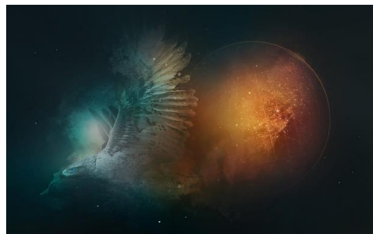
Willingness by Stellart Corsica (France)