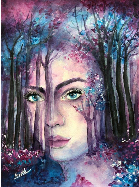
Lost in an Old Memory by Sara Arasteh (USA)