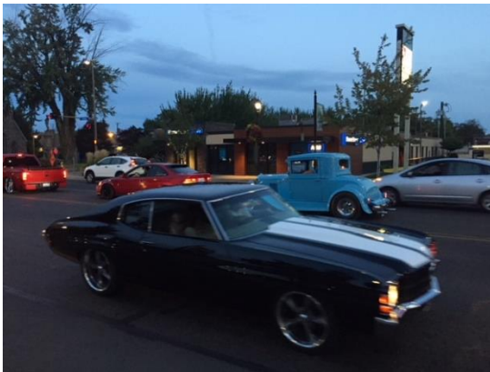
Saturday night cruising in downtown Yakima

A day later in Randle they discovered “baby” cinnamon buns much to my envy.