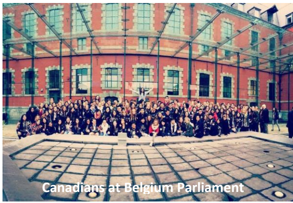
Canadians at Belgium Parliament