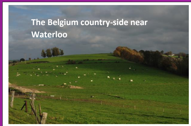
The Belgium country-side near Waterloo