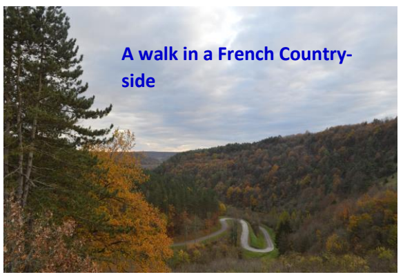
A walk in a French Country-side