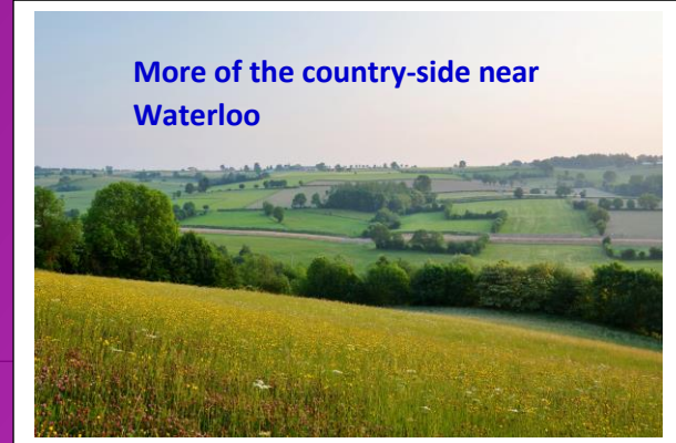
More of the country-side near Waterloo