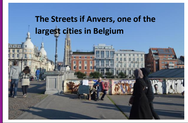
The Streets of Anvers, one of the largest cities in Belgium