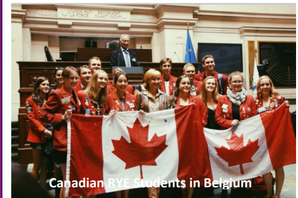
Canadian RYE Students in Belgium