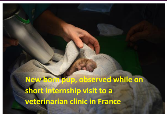
New born pup, observed while on short internship visit to a veterinarian clinic in France