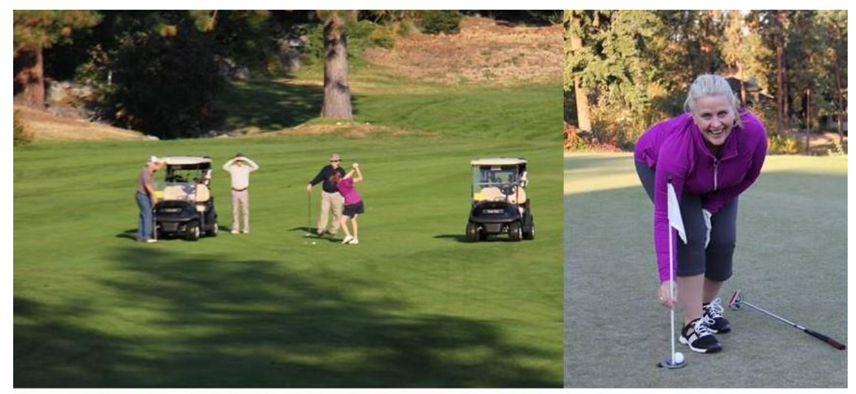
7<sup>th</sup> stroke on 2<sup>nd</sup> Fairway; only three more to go