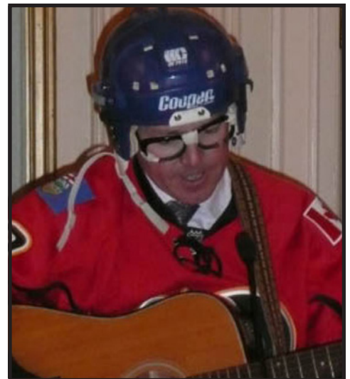
Bobby Clobber and The Hockey Song....