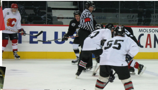
The Hockey Game