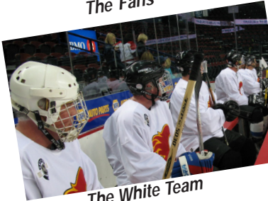
The White Team