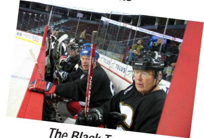
The Black Team