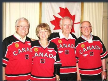
Our speakers – the "Gang of Four"