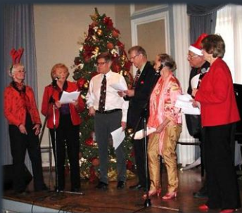
Salute to Santa...