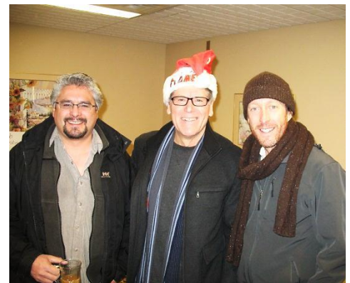
The Cardinal-Fras-Doyle gang at work