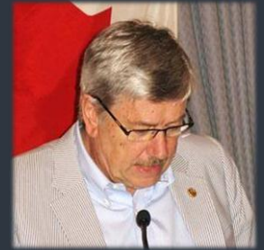
John Ridge synopsis of Bangkok RI Convention...