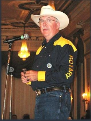
President Doug starts us up

steer down in less than four seconds! This act was followed by a beautiful dance duo, a combination of dance and gymnastics usually only seen in the figure skating pairs freestyle.