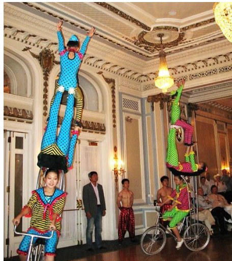
Where's the bike path?