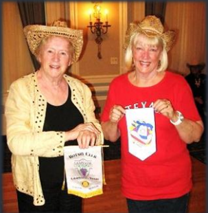
Banner exchange with Grapevine Texas Club