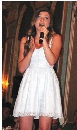
Patsy Cline, our version