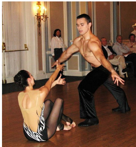
Takes two to tango...