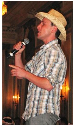
"I've got Friends in Low Places..."