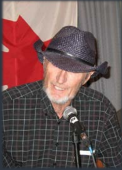
Guest appearance by Rotten Ralph