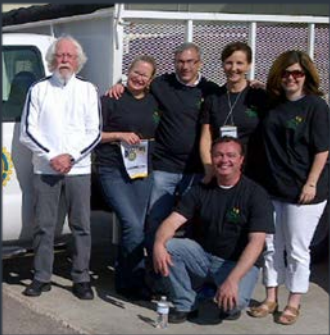
The Rotary Gang!