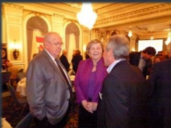
"Fellowship" exercise helped us get to know new friends