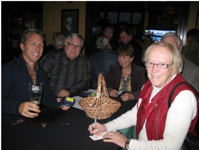
The welcoming committee