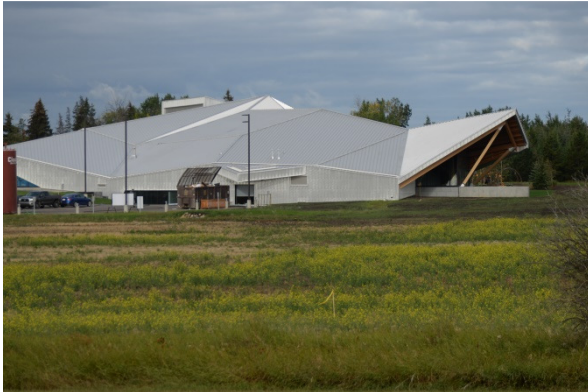
Visit the Philip J. Currie Dinosaur Museum