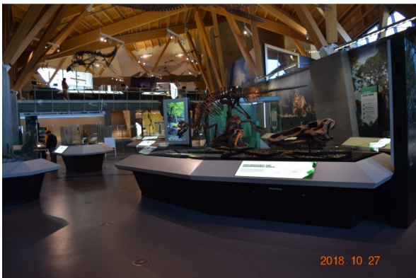
Tour the Philip J. Currie Dinosaur Museum.