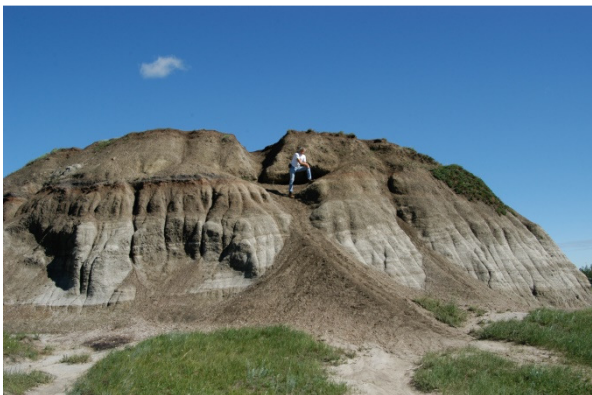
Explore the Kleskun Hill Natural Area.

Proceeds generated from this tour support the work of the Dinosaur Research Institute, a non-profit charitable organization which finances dinosaur research in western Canada.