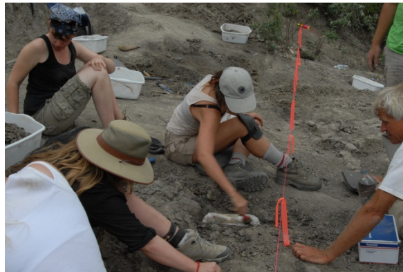
Dig in the Pipestone Creek Bone Bed.