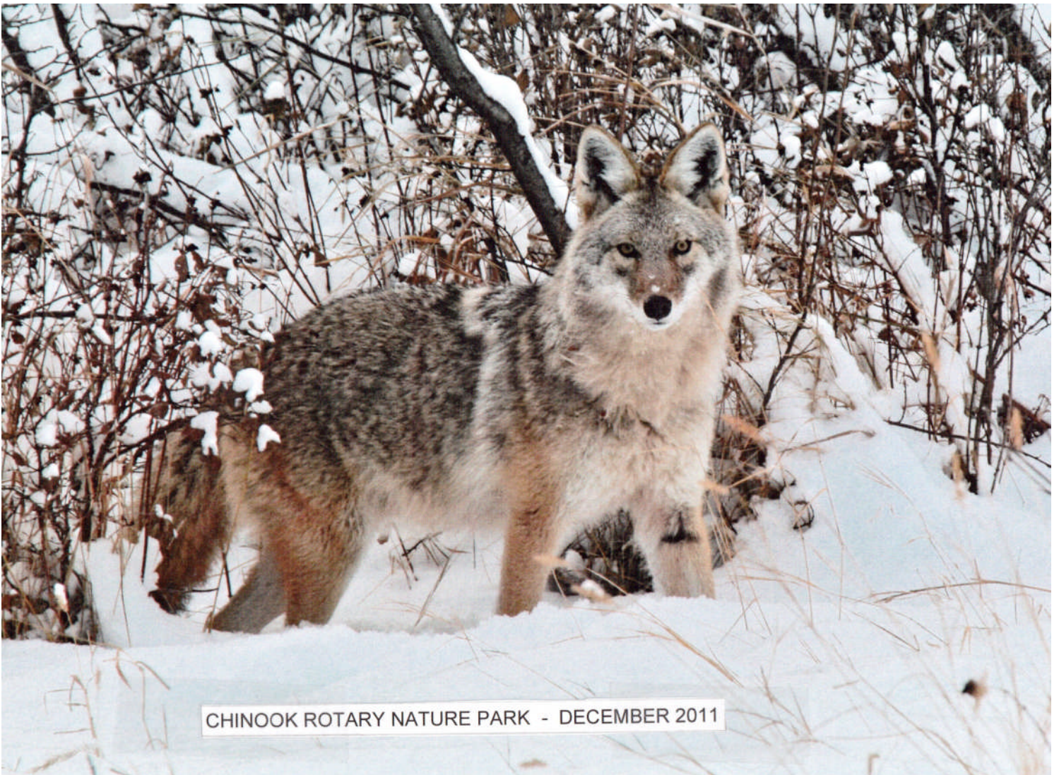
CHINOOK ROTARY NATURE PARK - DECEMBER 2011