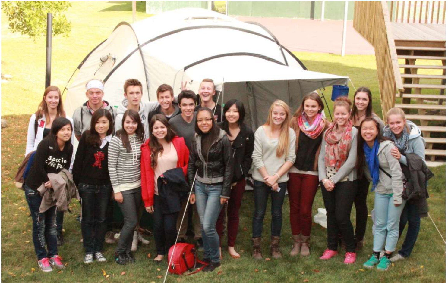
Photo credits to District YEX Committee, it will also be used in a future DG newsletter article