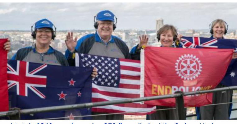
A total of 340 people waving 278 flags climbed the Sydney Harbour Bridge to break two world records. But the biggest win of all was the money -- and awareness -- raised to help end polio.