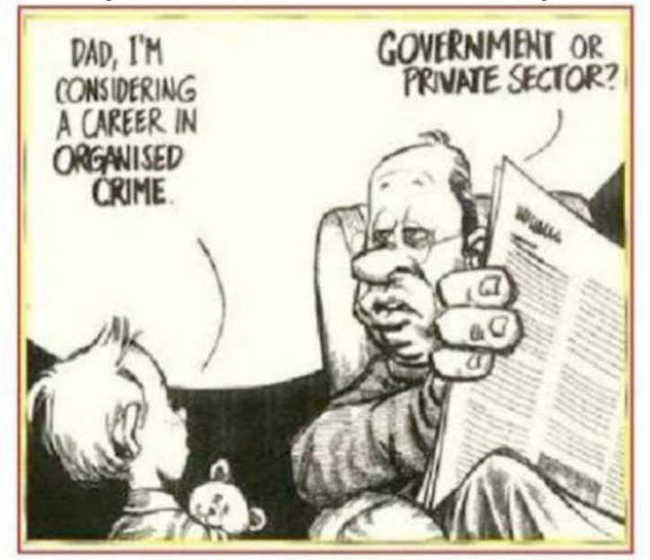
I personally would suggest government. They never go to jail.