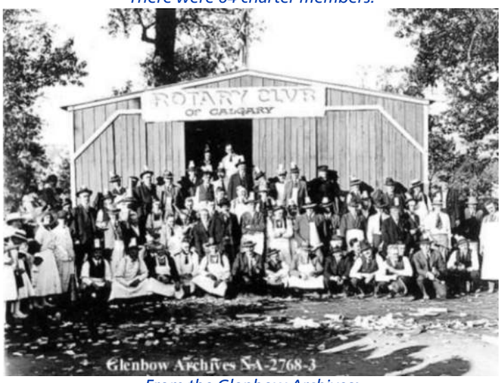
Picnic - Rotary Club of Calgary - District 5360 - Canada in 1920

The R C of Calgary, established in Calgary Alberta in 1914 was Alberta's first men's voluntary service organization. There were 64 charter members.