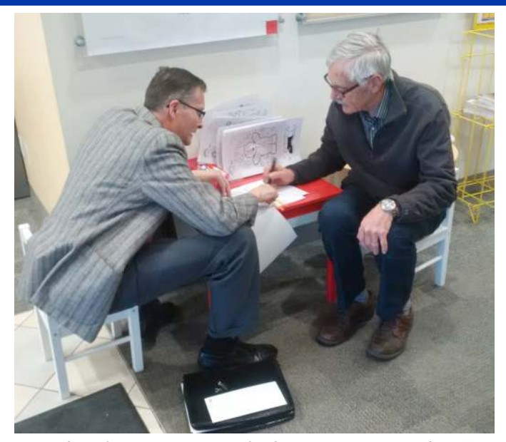
Why do Rotarians do business together? It's child's play!