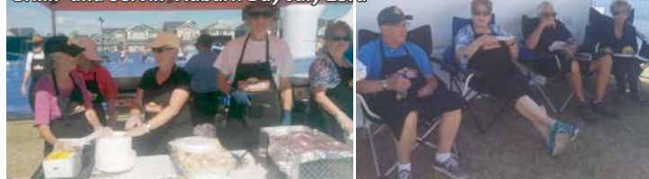
Grillin' and Servin' Auburn Bay July 23rd