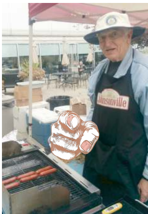
Uncle Hank needs YOU!!