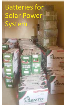
Batteries for Solar Power System