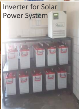
Inverter for Solar Power System