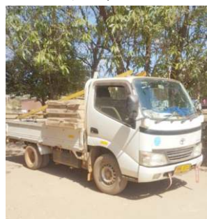
Arrival and installation of the Solar Panels

This is a $106,000 USD component of the project and will cover much of the campus including houses.