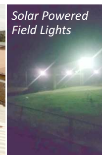
Solar Powered Field Lights