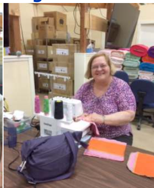
A regular volunteer sewer