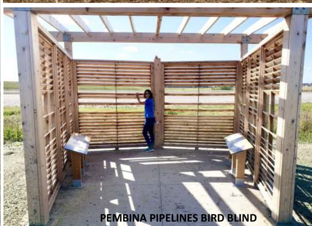
PEMBINA PIPELINES BIRD BLIND