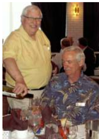
How our new President hopes to be treated over the next 12 months!?