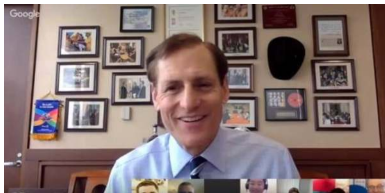
- John Hewko, General Secretary & CEO, Rotary International in Rotary Voices

As the world wears off the COVID-19 pandemic and promising vaccine candidates emerge, we face the daunting task of ensuring that all people, including those in vulnerable communities, are vaccinated. What are the key components of the polio eradication program that can be applied to the fight against COVID-19?