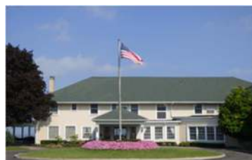
Niagara Falls Golf & Country Club

We will be sending additional reminders, but urge you to set your calendar now and register for this year's event. Full details and registration forms are available at www.USCGFR.com . We look forward to seeing you in October!