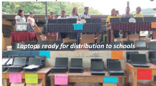
Laptops ready for distribution to schools