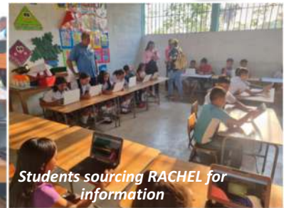
Students sourcing RACHEL for information

World Possible (Mundo Posible), has developed an inexpensive digital library — RACHEL — that provides thousands of electronic books — textbooks, reference books, classics, Wikipedia, other reading material — plus educational videos, games and applications to students with poor or no access to the Internet. This current approved project will provide the following: