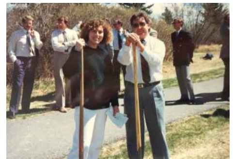
Tree Planting at South Glenmore Park, 1985 Mayor Ralph Klein and exchange student

roots, a lack of regular watering and the City unwilling to help maintain the beautification plan. Mayor Ralph Klein showed his support in 1985 by joining us in the labour of planting. His successors did not share the vision, and Parks decided tree additions be in clusters. Our dedication stone remains near the pathway on site.