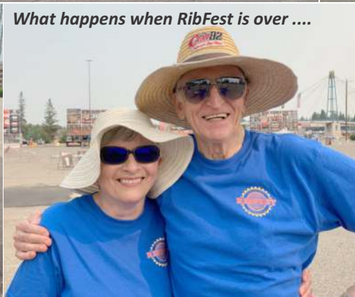
What happens when RibFest is over ....