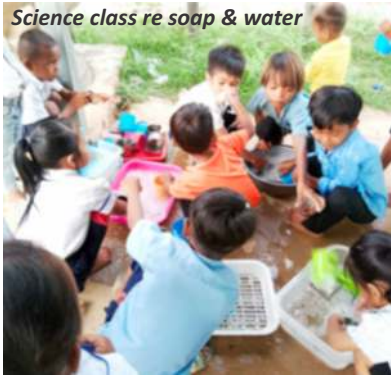
Science class re soap & water