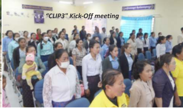
"CLIP3" Kick-Off meeting