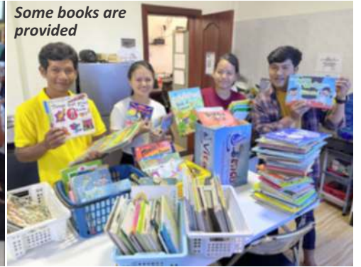
Some books are provided