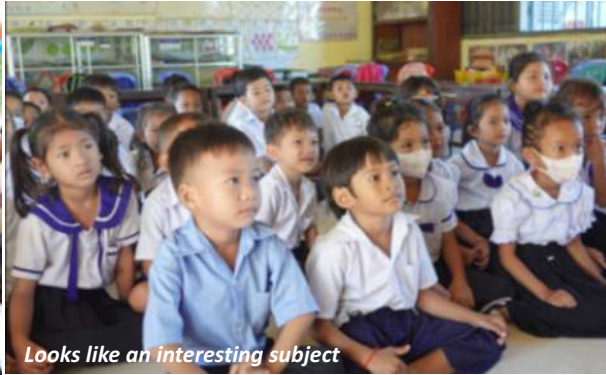
Looks like an interesting subject