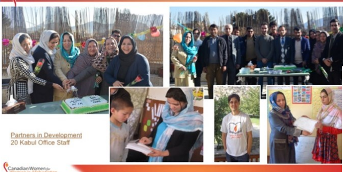
Partners in Development 20 Kabul Office Staff