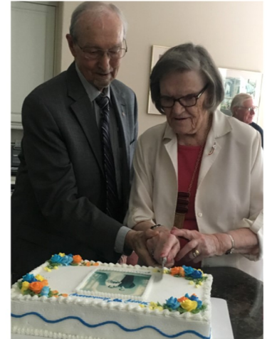
THIS PHOTO IS FROM